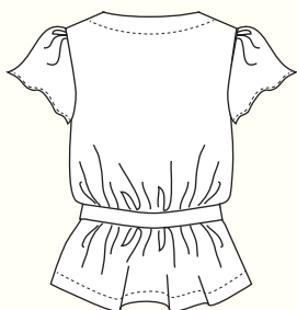
B - BACK

© 2014 Sewaholic Patterns | Made in Canada | Printed on recycled paper